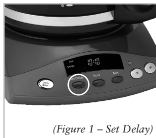
(Figure 1 – Set Delay)

To check the programmed time, push the SET DELAY button. The display will show the time you have programmed the coffee to brew.