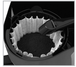
(Figure 2 – Adding water and ground coffee)