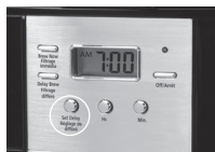
(Figure 1 – Set Delay)

NOTE: Pressing any button before setting the clock will cause the clock to start keeping time from 12:00 a.m. You must set the clock if you want to use the Delay Brew feature.