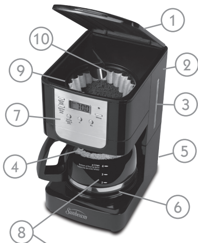
DIAGRAM OF PARTS