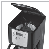
(Figure 2 - Adding water and ground coffee)